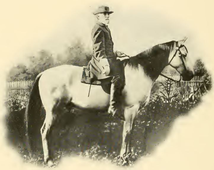
GEN. ROBERT EDWARD LEE.